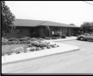
Celebration of Health Association